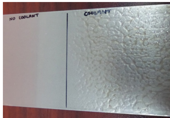
COATING COMPARISON: NO COOLANT VS. COMPETITIVE COOLANT